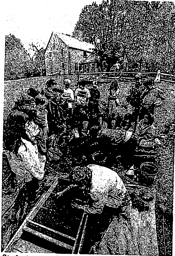
Students watch UMass/Amherst archaeologists at the site of the new barn at the John Alden House.

On Saturday, Oct. 18, the Alden House Museum, 105 Alden St., will hold a groundbreaking ceremony for a new barn at 11. The event is open to the public, beginning at 10:30, and will include a reception, light refreshments, special exhibits and free tours of the Alden House.